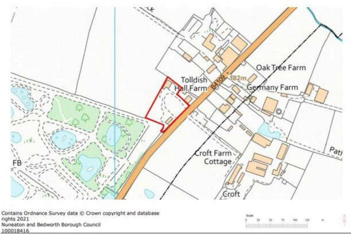
The Old Nursery, Parrotts Grove, Coventry - a proposed location for new traveller pitches