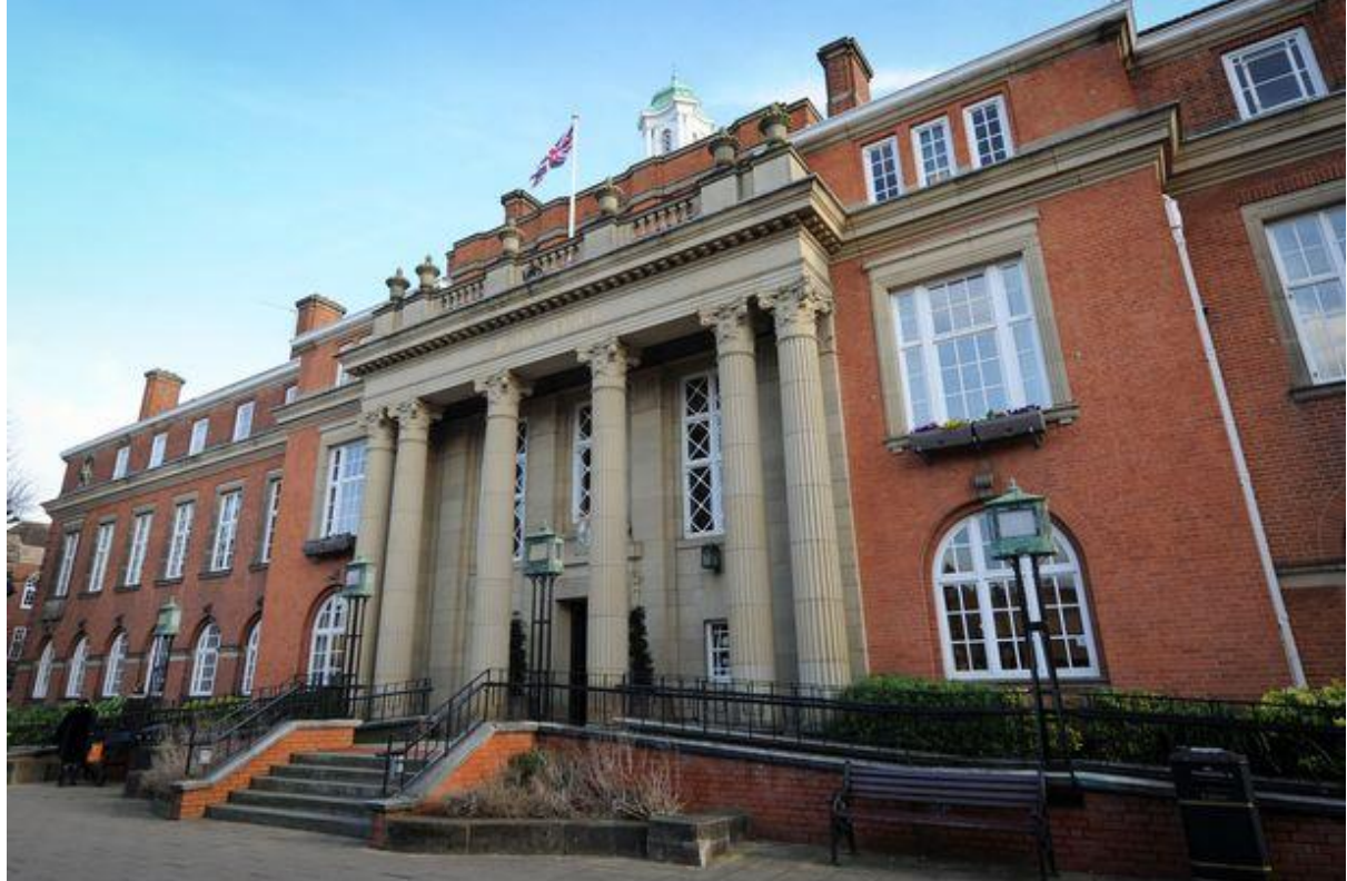
The council has three independently assessed proposed traveller pitches sites