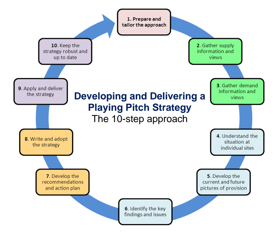
Figure 2: The 10 steps to delivering a Playing Pitch Strategy