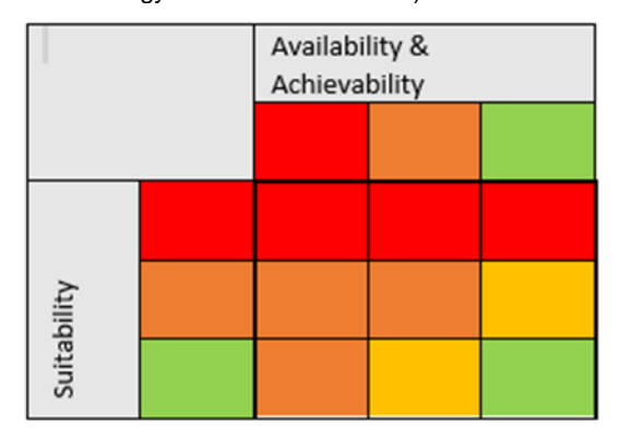
Figure 1: Example of a site assessment matrix (illustrative: each LPA would develop its own methodology for this level of detail)

3.8 To summarise: this document has been prepared jointly to ensure a consistent shared approach to identifying and assessing sites for housing and employment uses, which will be used by each Local Authority (or alliance of Local Authorities where shared plans are developed) as the framework within which they will develop their detailed assessment and selection processes.