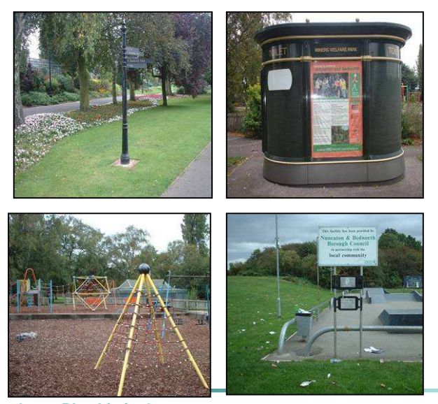
Jones Plus Limited Planning Policy Guidance 17 Assessment September 2006