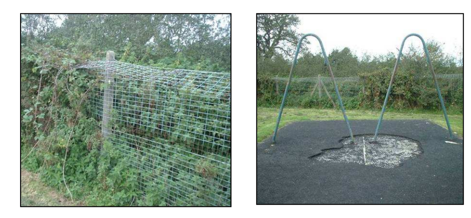
Jones Plus Limited Planning Policy Guidance 17 Assessment September 2006