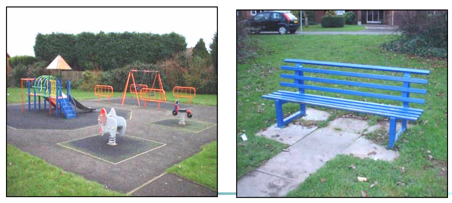
Jones Plus Limited Planning Policy Guidance 17 Assessment September 2006

This is a small area of residential open space that contains an equipped play area. The equipment is bright and attractive and includes a set of swings, a multi-play facility, and two rockers, most of which are in adequate condition, although there are no dog-proof measures.