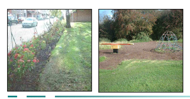
Jones Plus Limited Planning Policy Guidance 17 Assessment September 2006