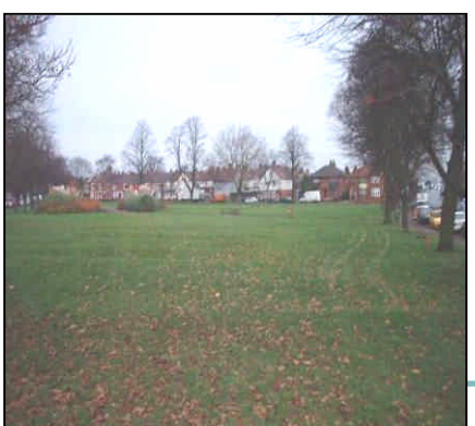
Planning Policy Guidance 17 Assessment September 2006

The site contains several shrub and plant beds although much of the shrubbery noted in 2004 has been cut back and / or removed by the time the site was re-visited in 2006.