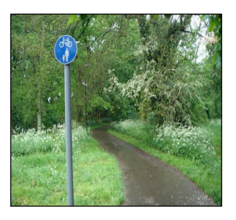
Jones Plus Limited Planning Policy Guidance 17 Assessment September 2006