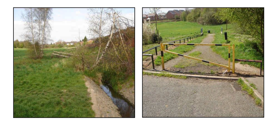
Jones Plus Limited Planning Policy Guidance 17 Assessment September 2006