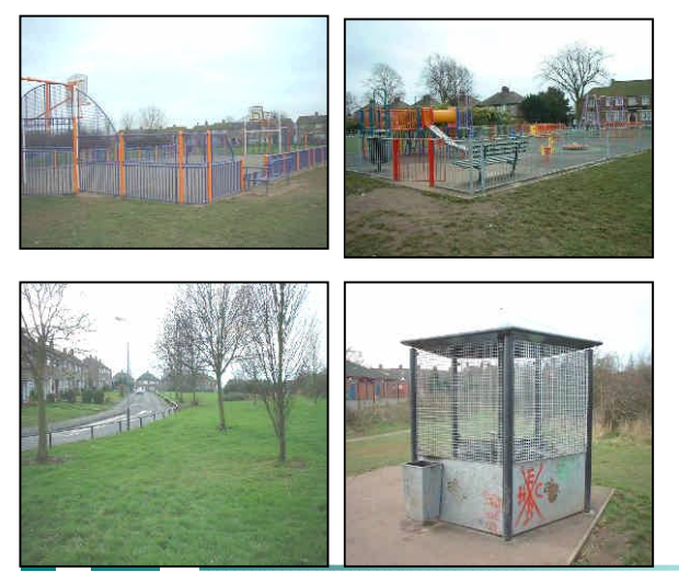
Jones Plus Limited Planning Policy Guidance 17 Assessment September 2006

This site has a range of recreational uses incorporating as it does a children's play area (high play value and well maintained), a multi-use games area, several sports pitches and extensive planted areas (part of the site is identified as a SINC following 2001 survey).