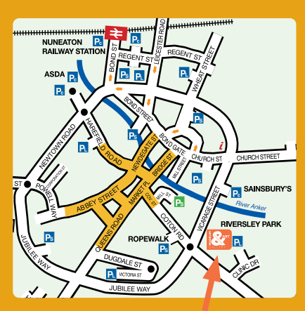
Nuneaton Museum & Art Gallery

The Museum is in Riversley Park near Ropewalk Shopping Centre and just off Coton Road and Vicarage Street. Approximately ten minutes' walk from Nuneaton train station and three minutes' walk from the town centre. Long and short stay car parks are nearby which include disabled parking. There is free parking for up to 3 hours next to the Museum building, or a pay and display area off Coton Road (turn left at Cocks Lloyd Solicitors, postcode CV11 5TX) Bus Routes: the closest bus stop is on Coton Road.