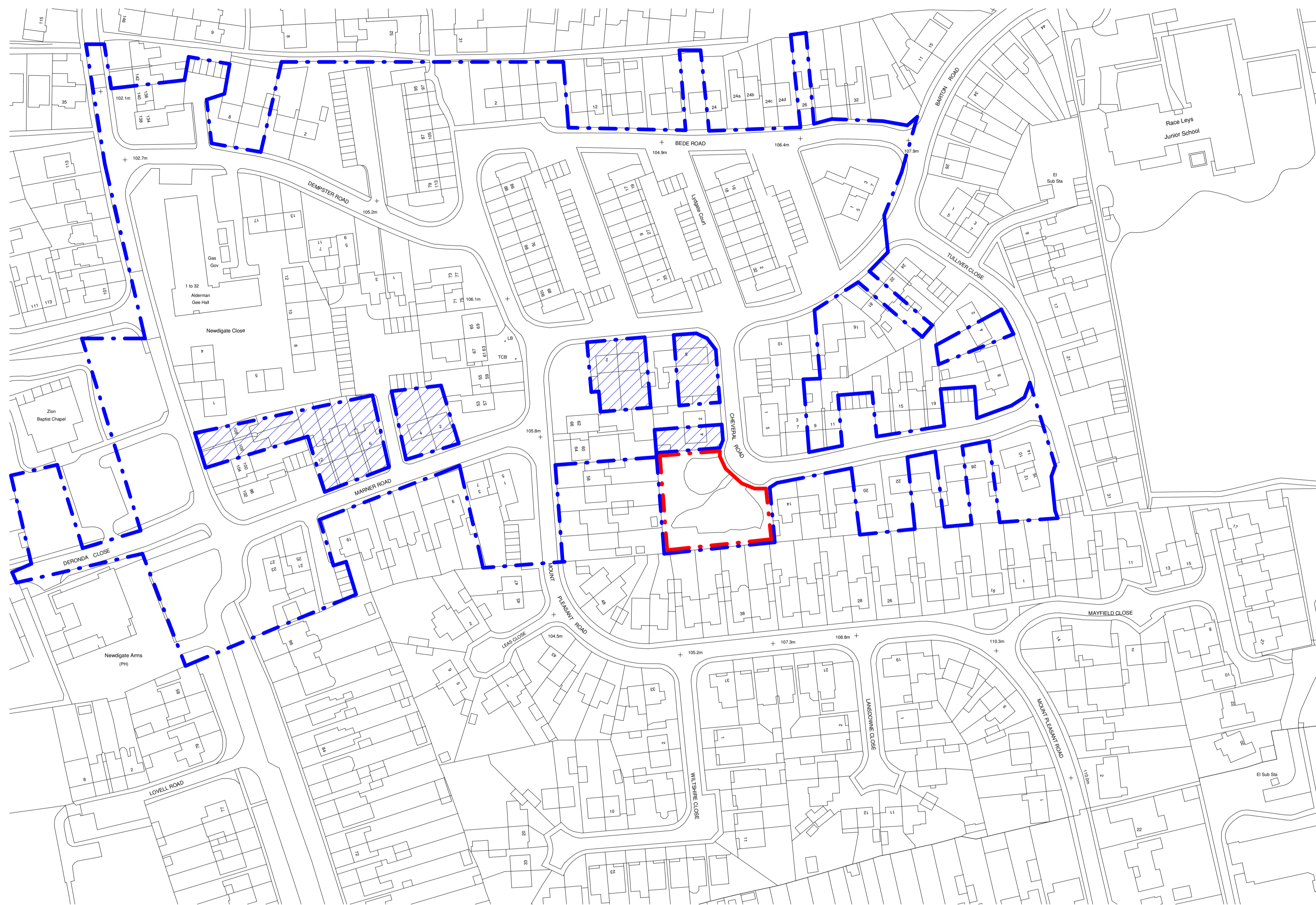
1. Site Location Plan SCALE - 1 : 100@A1